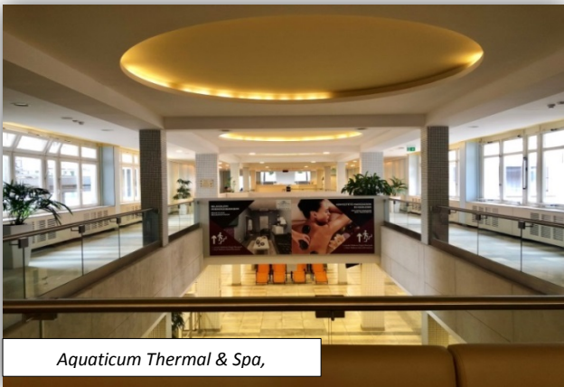
Aquaticum Thermal & Spa,