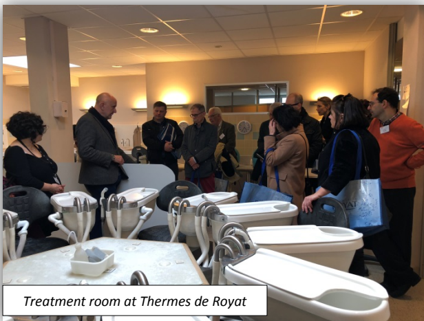
Treatment room at Thermes de Royat

With its 24 thermal resorts, the Auvergne-Rhône-Alpes region has made the thermalism a priority.