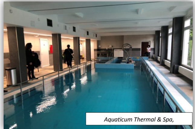
Aquaticum Thermal & Spa,