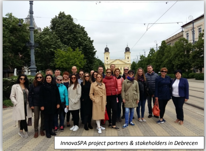
InnovaSPA project partners & stakeholders in Debrecen

The largest spa complex in Europe, "Hungarospa Hajdúszoboszló", located within the Hajdú-Bihar County was among the visited sites.