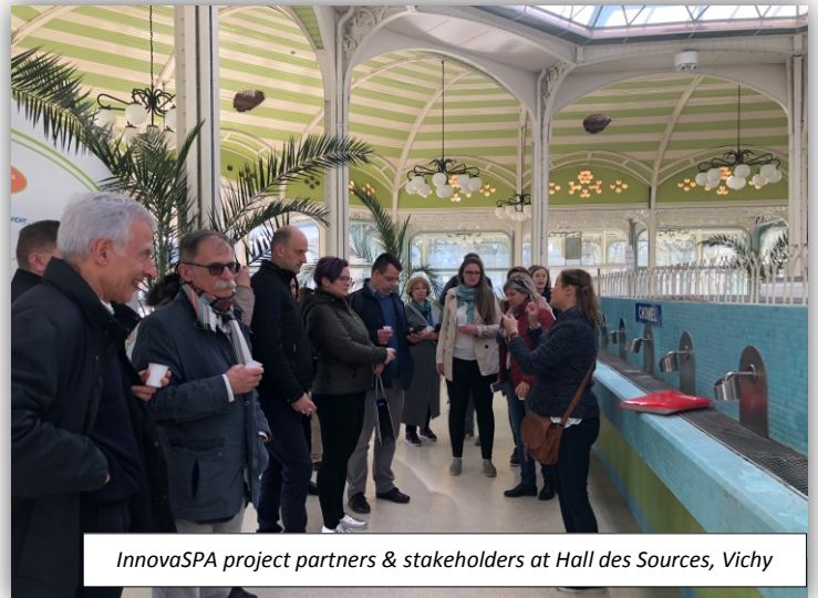
InnovaSPA project partners & stakeholders at Hall des Sources, Vichy

With its 24 thermal resorts, the Auvergne-Rhône-Alpes region has made the thermalism a priority.