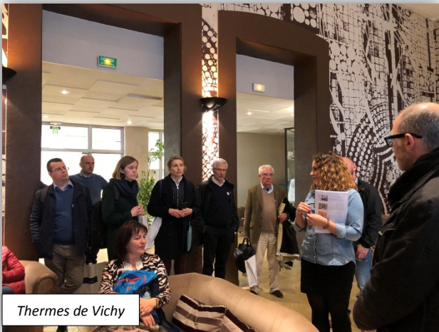
Thermes de Vichy