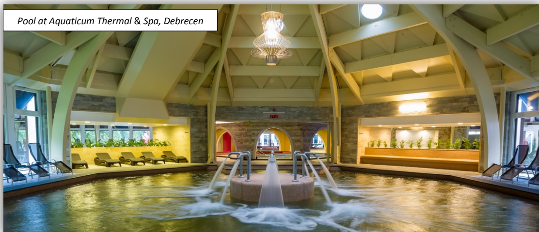
Pool at Aquaticum Thermal & Spa, Debrecen

The purpose of this complex good practice was to reflect the efficient use of the EU Structural Funds' resources in promoting thermalism and tourism attractions through the infrastructure