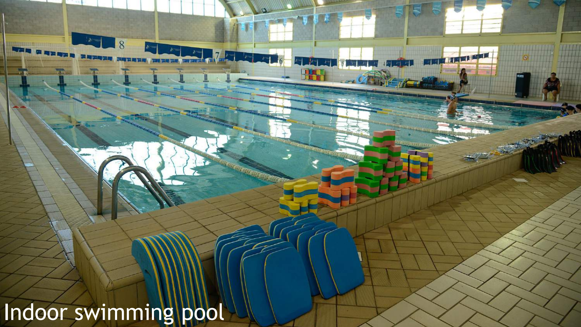
Indoor swimming pool